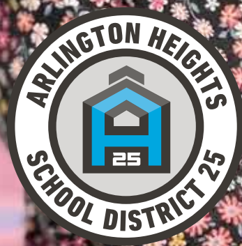
IMAGE: These two Ivy kindergarteners quickly became best friends in their District 25 kindergarten classroom.