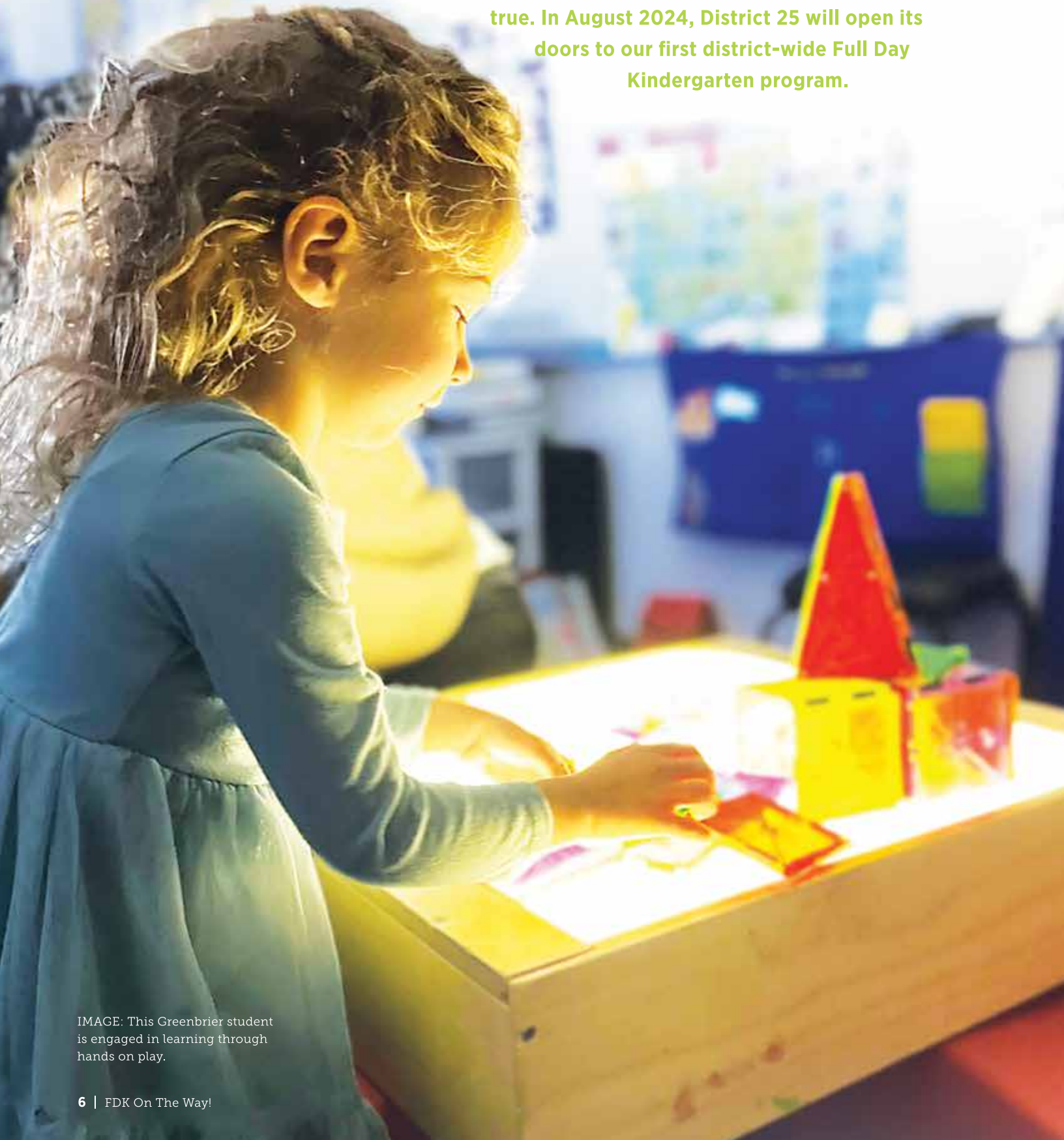
IMAGE: This Greenbrier student is engaged in learning through hands on play.

Here in District 25, we are always excited for the start of the school year, but this fall, that rings extra true. In August 2024, District 25 will open its doors to our first district-wide Full Day Kindergarten program.