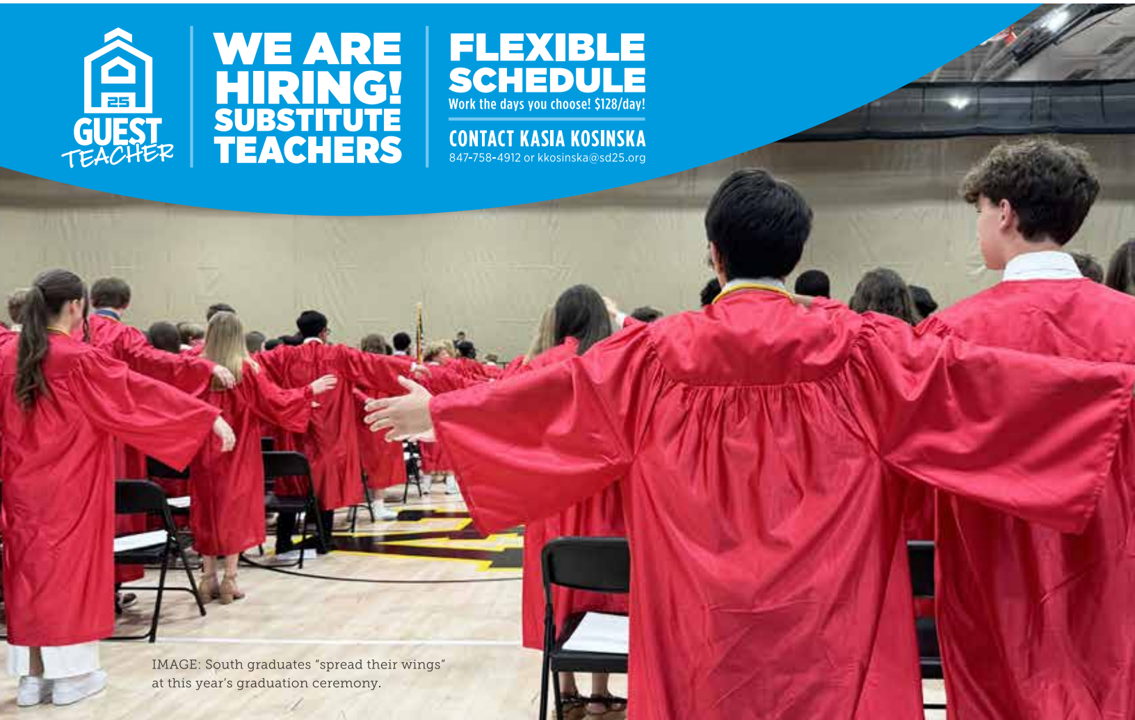
IMAGE: South graduates "spread their wings" at this year's graduation ceremony.