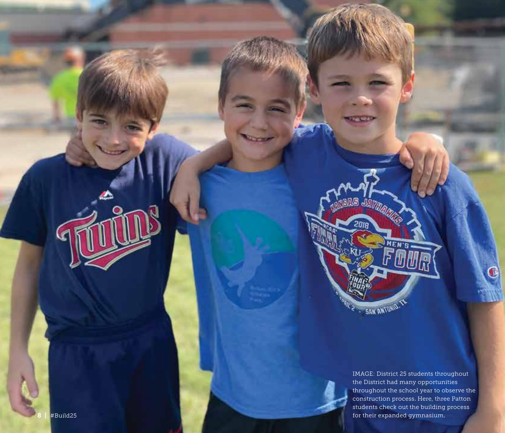
IMAGE: District 25 students throughout the District had many opportunities throughout the school year to observe the construction process. Here, three Patton students check out the building process for their expanded gymnasium.