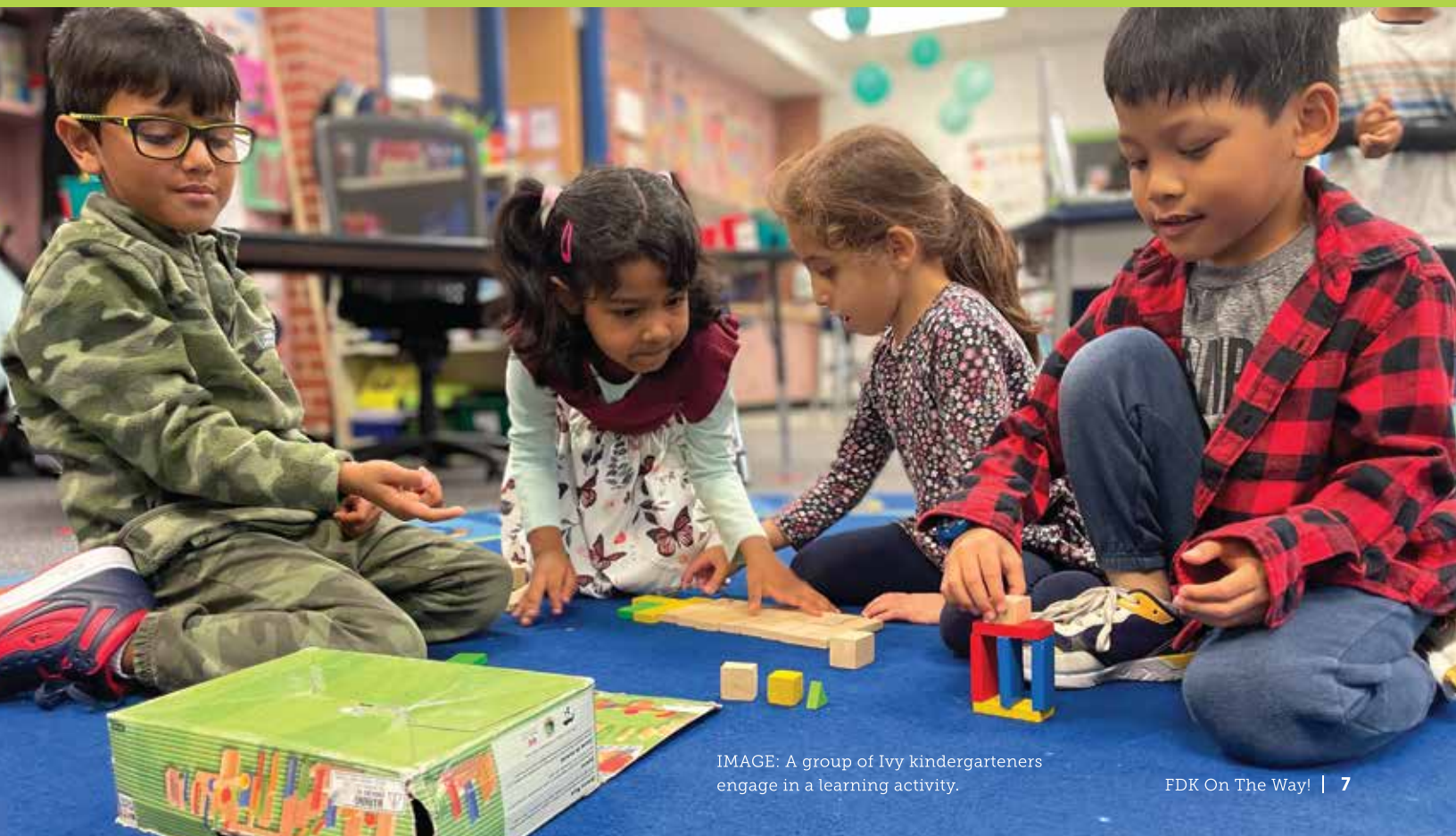
IMAGE: A group of Ivy kindergarteners engage in a learning activity.

FOR MORE DETAILED INFORMATION ON OUR FULL DAY KINDERGARTEN PROGRAM, INCLUDING FAQ'S, AND DETAILS ABOUT OUR PLAY-BASED LEARNING CURRICULUM, VISIT WWW.SD25.ORG/KINDERGARTEN , OR SCAN THE QR CODE TO WATCH A VIDEO ABOUT OUR FULL DAY KINDERGARTEN PROGRAM.